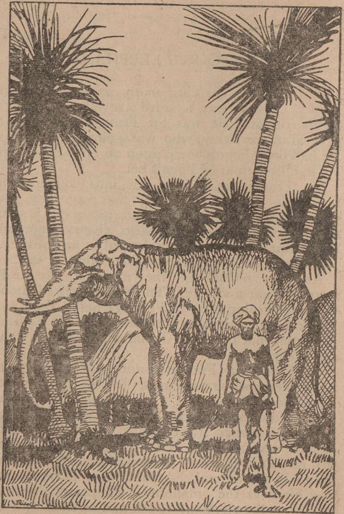
The elephant that belonged to an Indian.