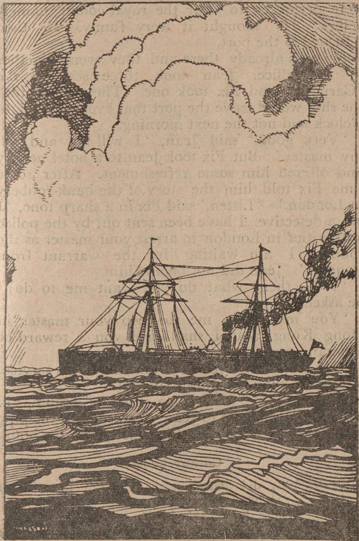
The Steamer on its way to Hong Kong.