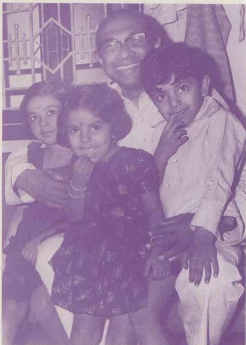
They are comfortable