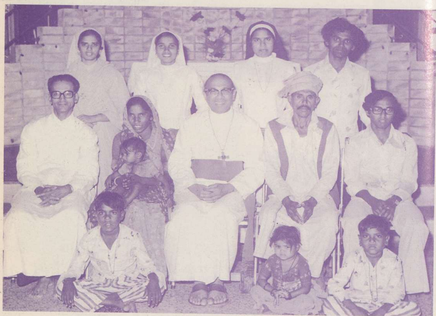
With a newly baptized family