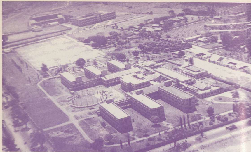
Dharmaram the Dream