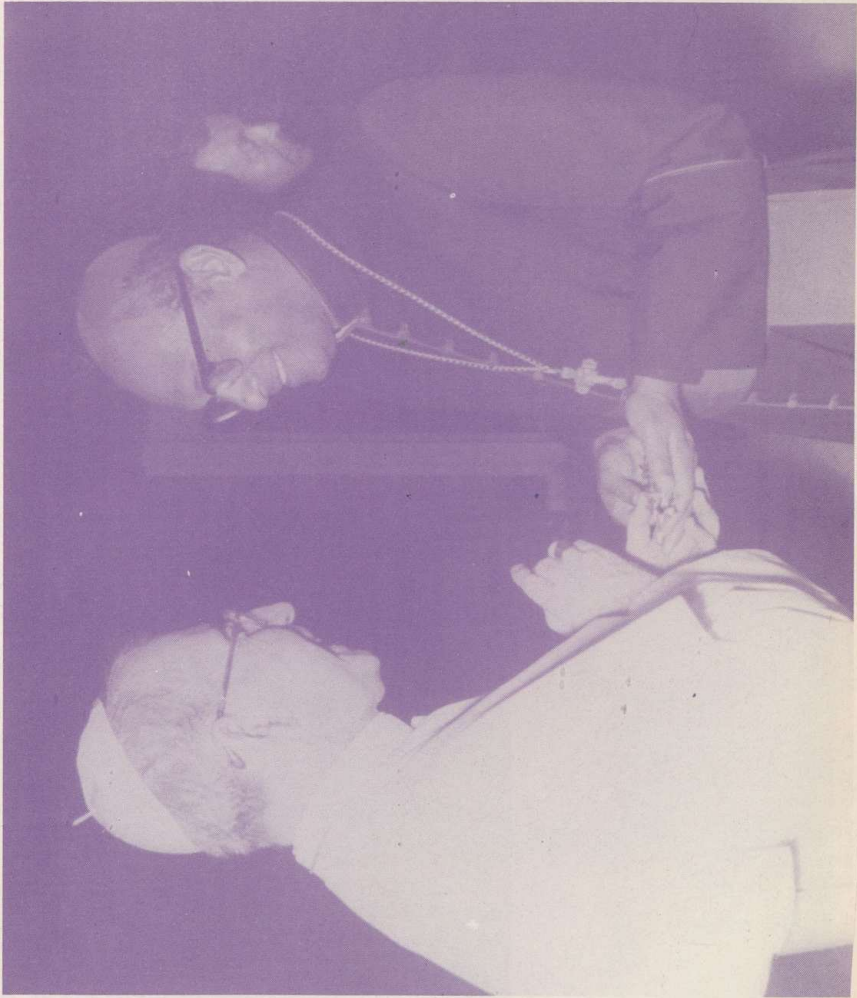
With the Holy Father Pope John Paul I