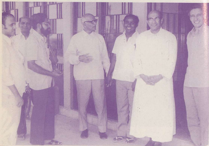
The first visit of Bishop elect to the Diocese