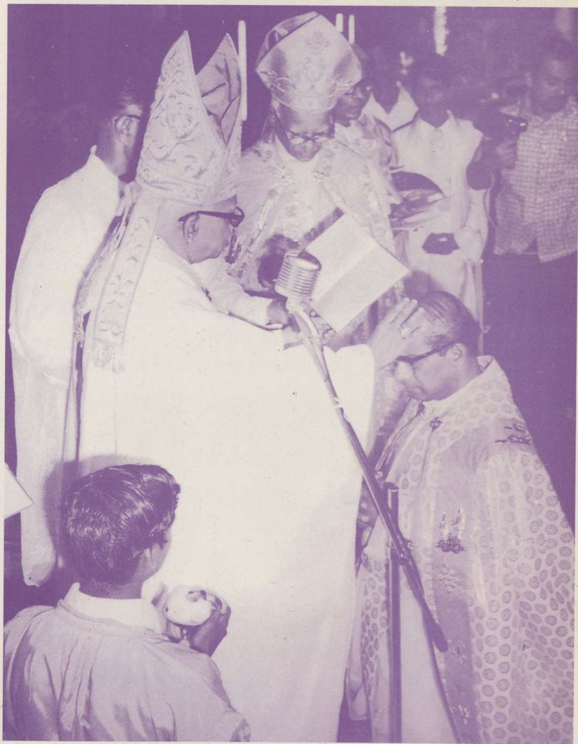
Episcopal Ordination in Mannanam