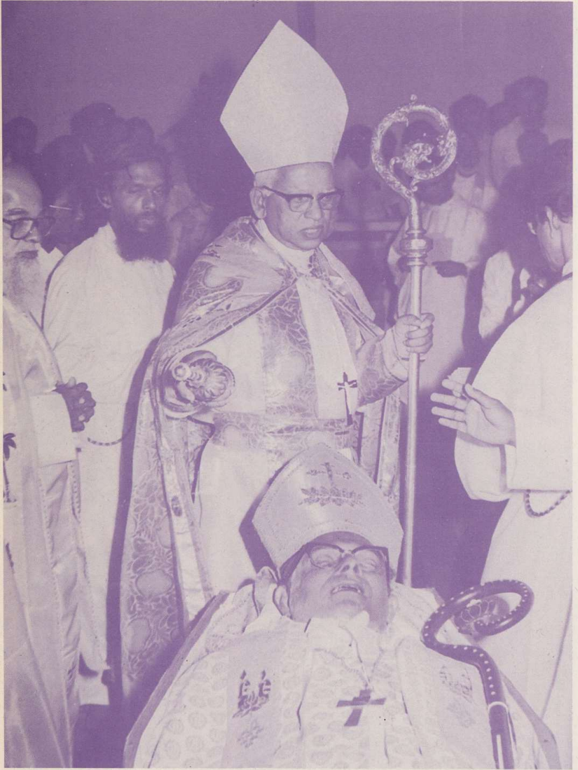
Journey to Eternity