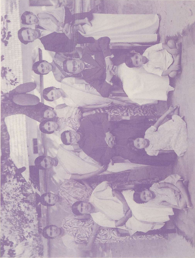
Newly Ordained Priest with family members