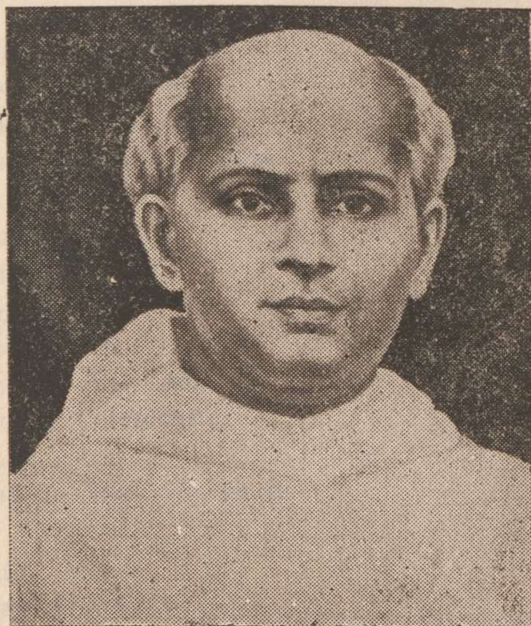
Blessed. Fr. Kuriakose Elias Chavara